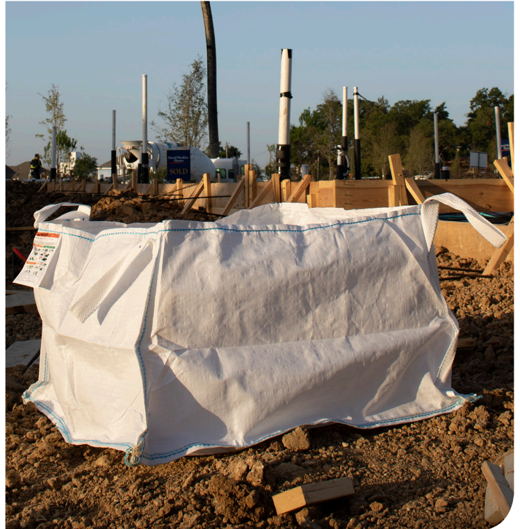
Dimensions: 40"L x 40"W x 24"H